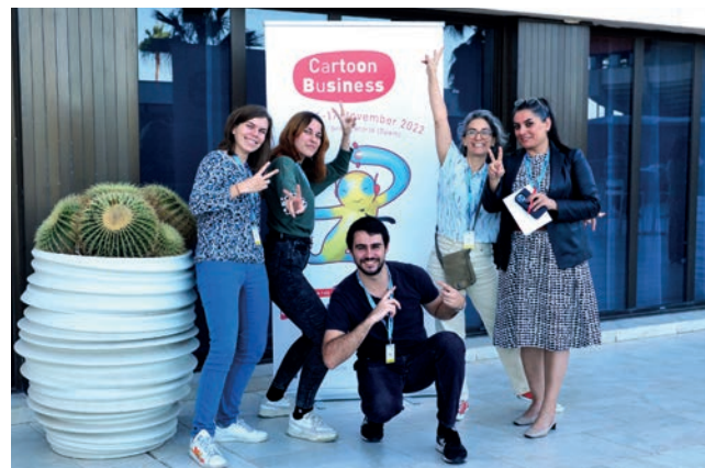
Cartoon Business © Cartoon Media