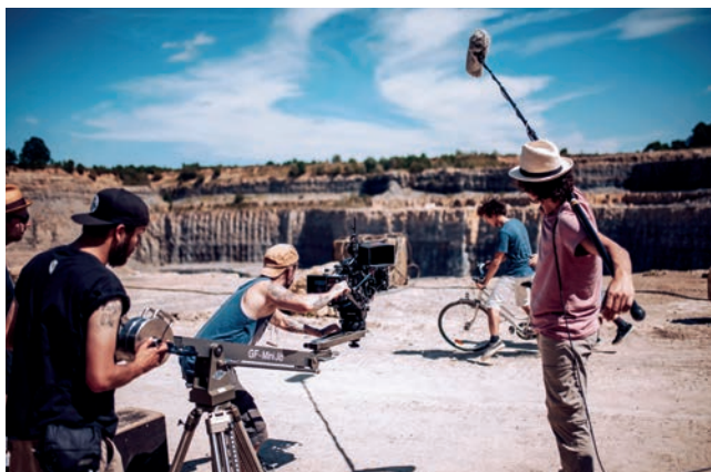
»Unter Strom«, Making of