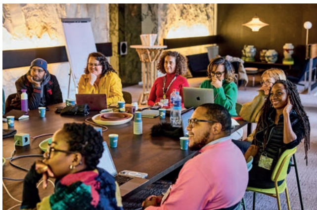
IFFR Indaba 2023