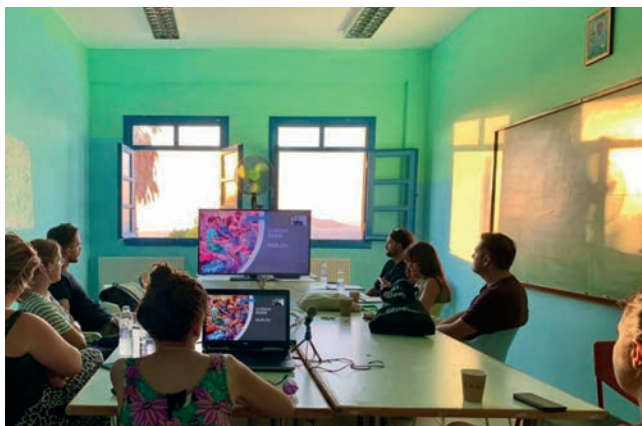
MFI Script 2 Film Workshops © MFI