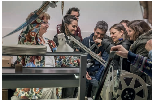
APostLab © Edmond Laccion