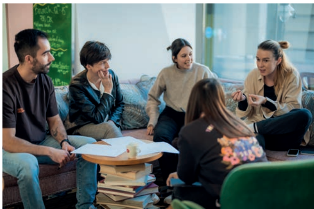
Series Launch