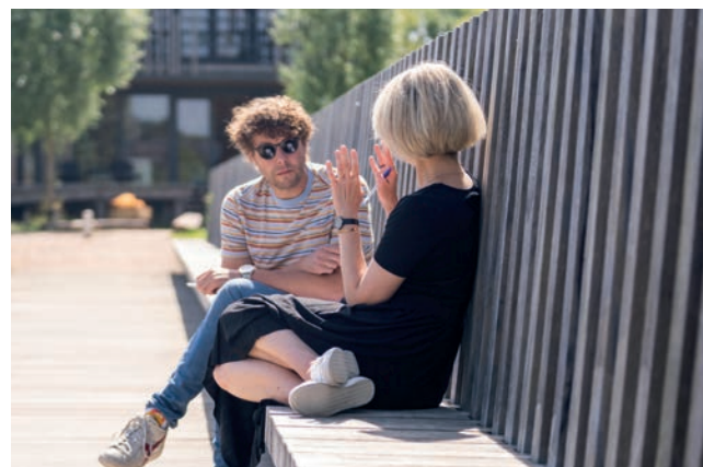
ACE Producers