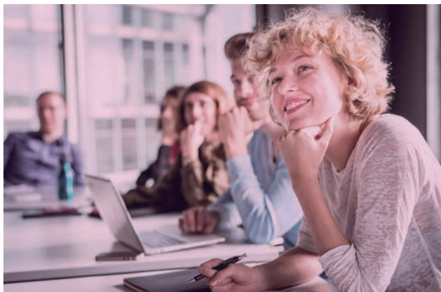
Serial Eyes