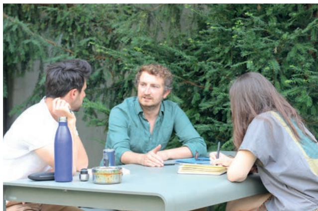
ISI Sustainability Management